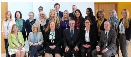
Maths & Business