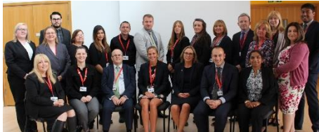
Science & Technology