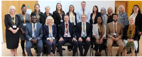
Humanities & Expressive Arts