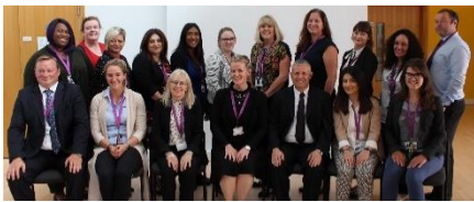
English & MfL