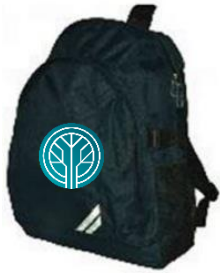
Park school bag