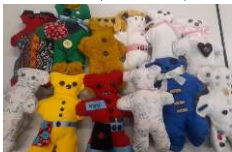
Year 7 Bears Project