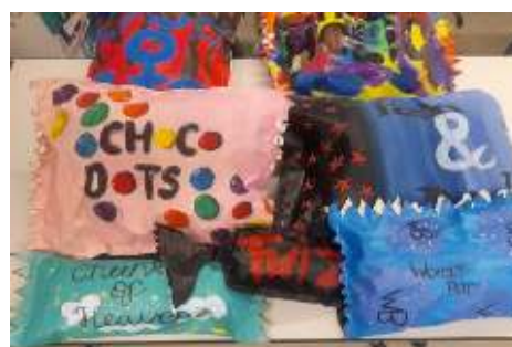
Year 9 Paper Food Sculpture