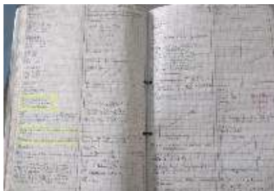
Vietloc Tran (Year 7)